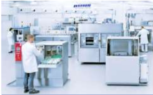
Machine Test Center