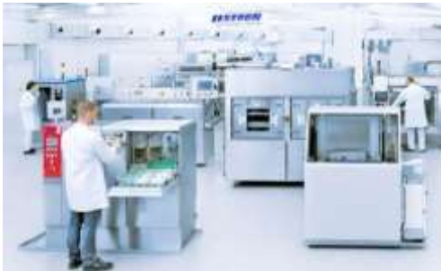
Machine Test Center